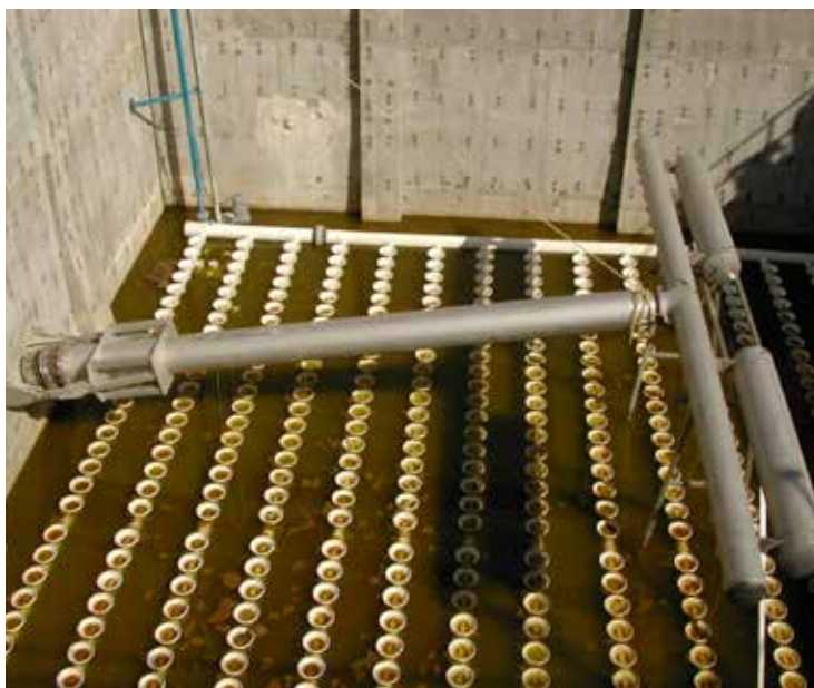
A decanter from Läckeby Products installed at Buenaventura, Chiapas in Mexico.

As standard, decanters are manufactured in stainless steel or acid-proof steel. The outlet pipe is equipped with a flexible joint at the lower end. This solution also includes support for the decanter when draining the SBR tank. The decanter from Läckeby Products requires minimal maintenance, as it has no pumps, valves or electric operations.